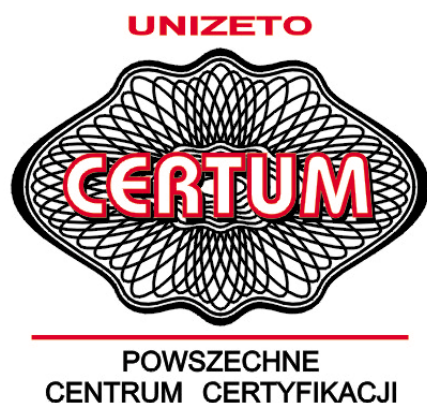
Fig. 9.1 CERTUM Logo

Unizeto Technologies S.A. owns registered trade mark, consisting of graphic mark and inscription, which constitute the following logo: